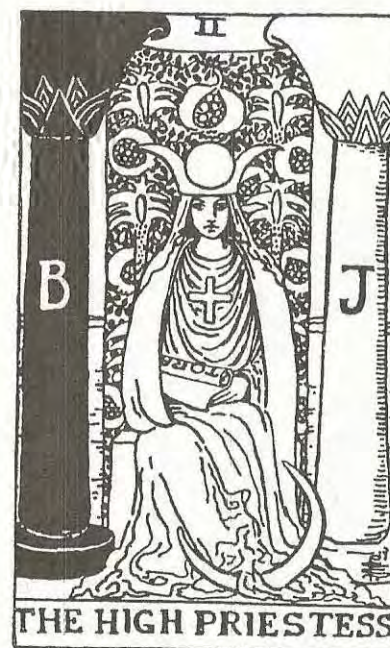
THE HIGH PRIESTESS