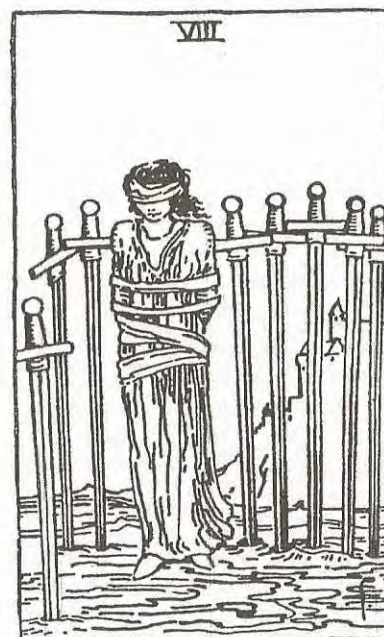
EIGHT OF SWORDS