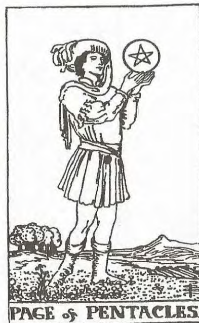
PAGE OF PENTACLES