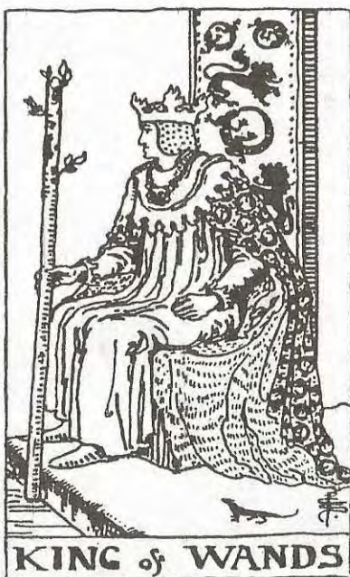
KING OF WANDS