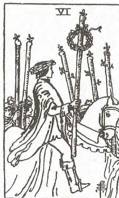
SIX OF WANDS