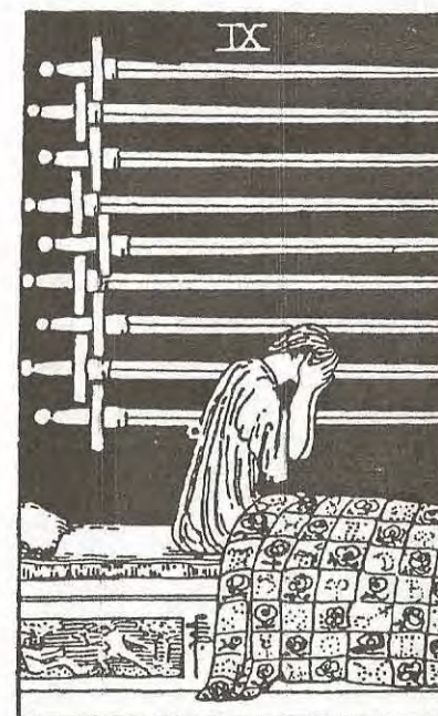
NINE OF SWORDS