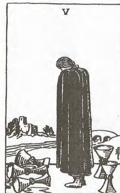
FIVE OF CUPS