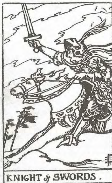
KNIGHT OF SWORDS