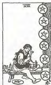
Eight of Pentacles

being the end of the eighteenth century—but secondly a virtuoso in general occult arts whose zeal was in advance of his discretion and out of all measure in respect of his learning. The Marseilles pack is very much better, but this also is not at the corner of the streets, either in the city which has given it an imprint or in the great centre of Paris. Bolognese and Venetian Tarots are mentioned rather than seen.