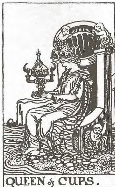
QUEEN OF CUPS