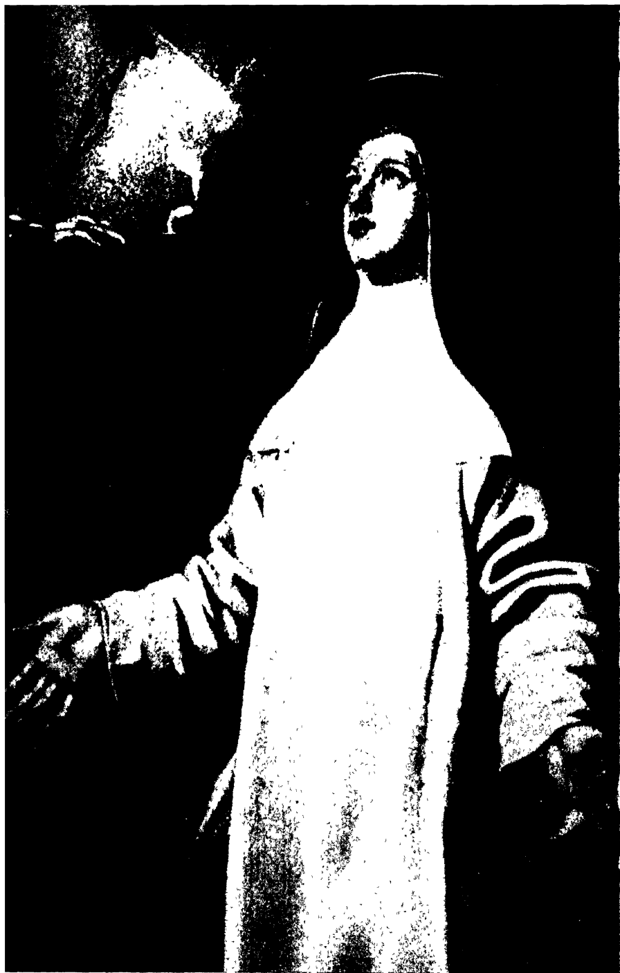
PLATE VIII: BLESSED BÉATRIX D'ORNAGIEU, CARTHUSIAN NUN