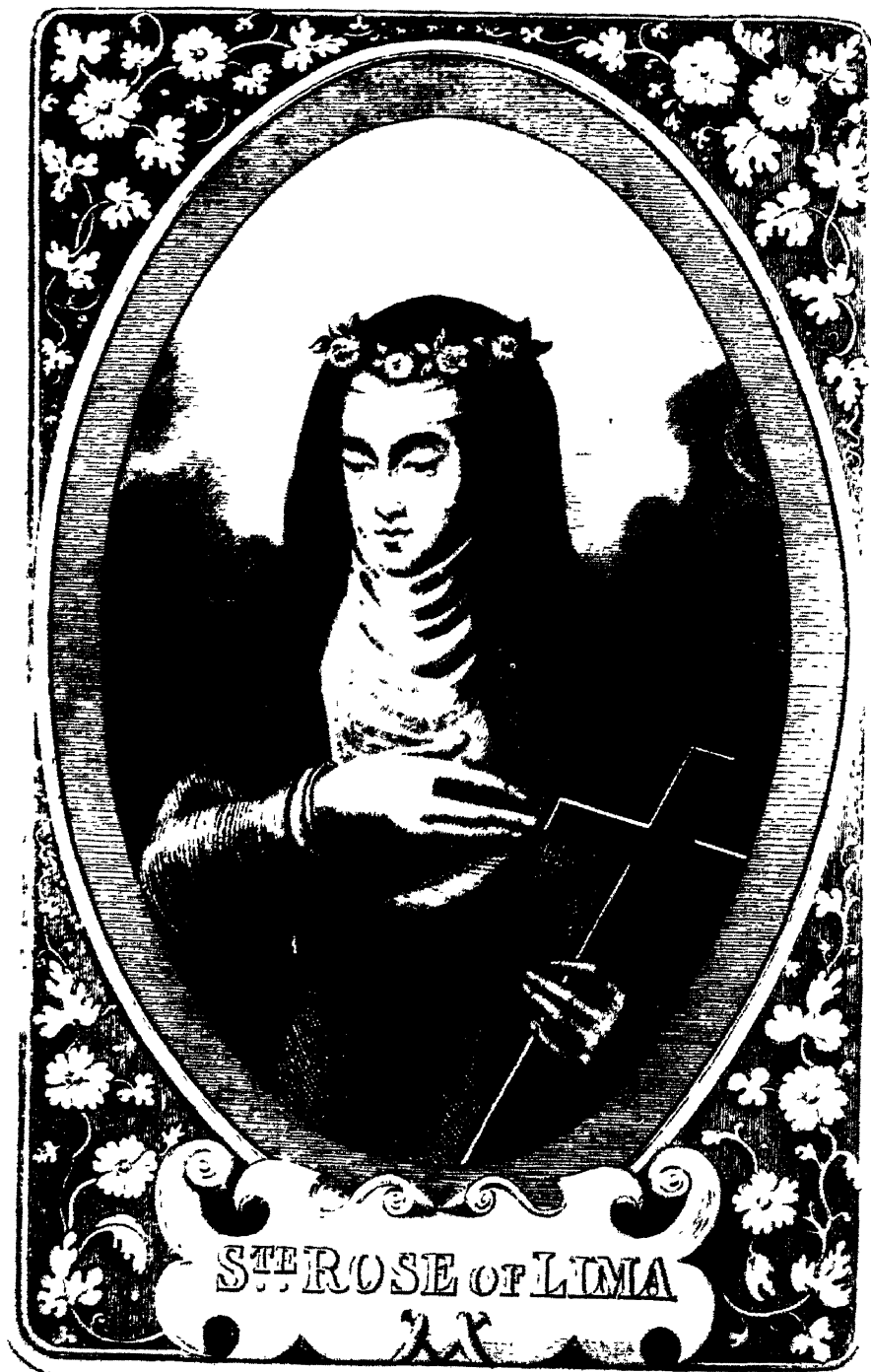
PLATE VI: ST. ROSE OF LIMA