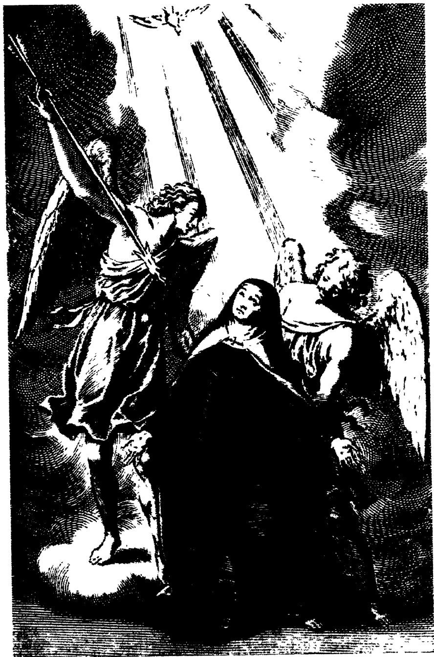
PLATE XI: THE TRANSVERBERATION OF THE HEART OF ST. TERESA

Les Œuvres de la Sainte Mère Terèse de Jésus. Paris: 1050