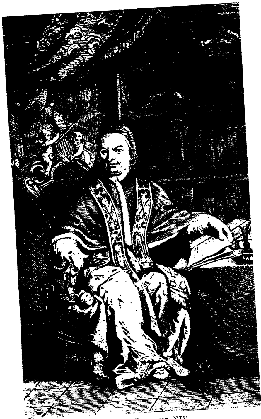
PLATE X: BENEDICT XIV