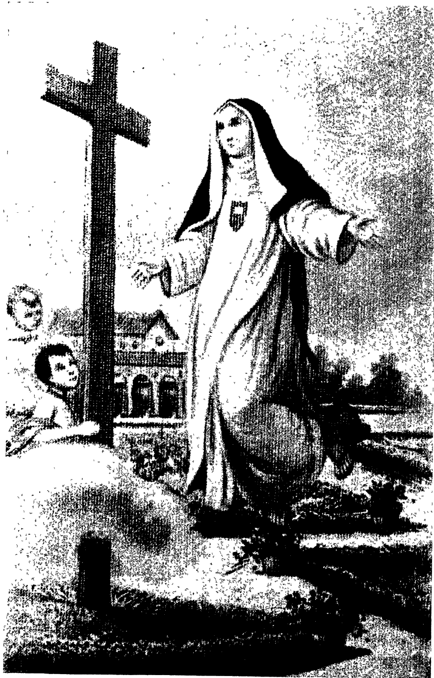
PLATE II: BL. MARIANNA DE JESÚS From a painting by Mercedarian