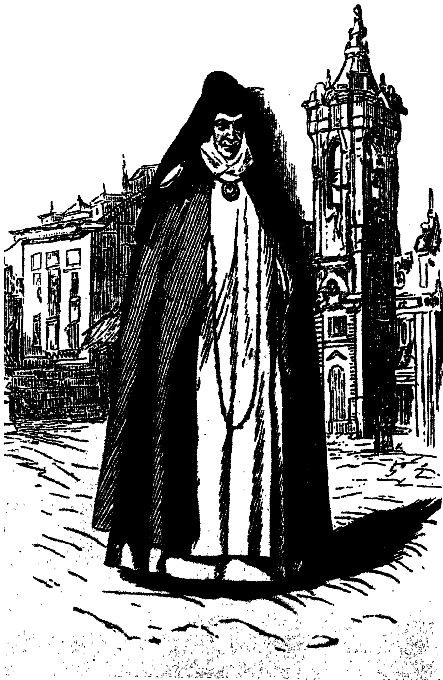
PLATE IV: SOR PATRGINIO From a contemporary print, 1868