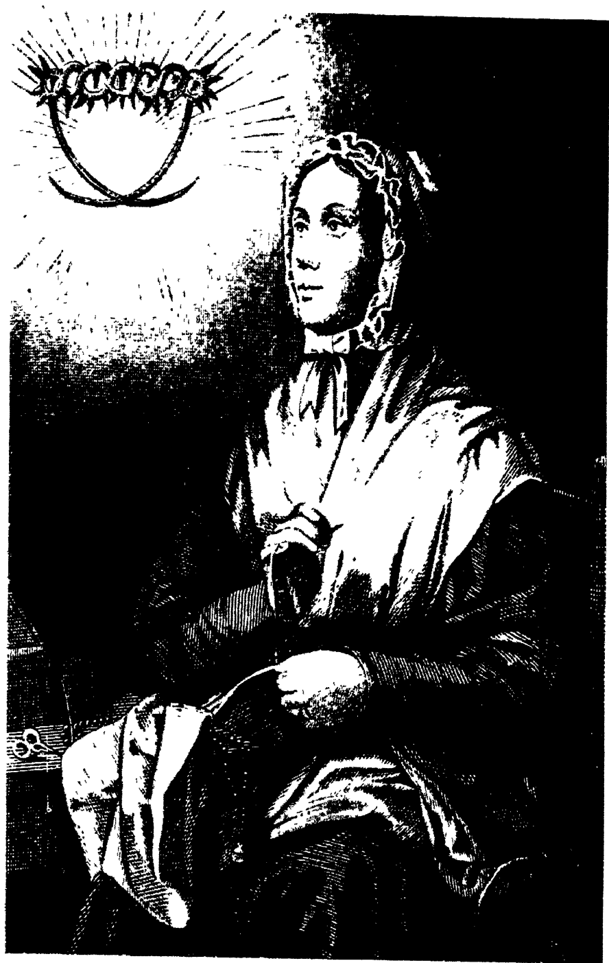
PLATE V: BLESSED ANNA MARIA TAIGI, A ROMAN MYSTIC